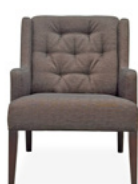
button look option 2