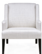
plain back option 1